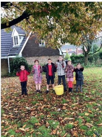
Haughton's Eco Council and Christmas Shoe Box Appeal

A huge thank you to everyone who contributed and supported this wonderful cause.