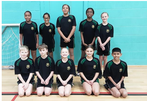
Children from Woodfield Primary School's athletics team