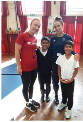
Chelsie Giles, Olympian visits Woodfield